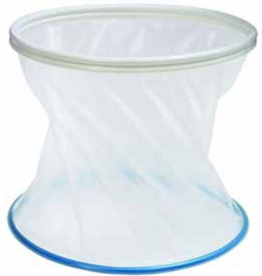
ViClean™ Wound Protectors (RIGID + FLEXIBLE RING)

Reid K, Pockney P, Draganic B, Smith SR. Barrier wound protection decreases surgical site infection in open elective colorectal surgery: A randomized clinical trial. Dis Colon Rectum. 2010;53(10):1374-1380.