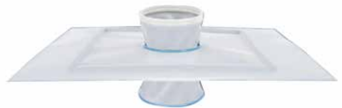
Wound Protector with Attached Drape/Waste Collection